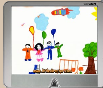
Shown with Little Director™ animated pediatric fixation.