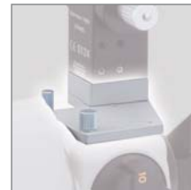
» Tonometer Mount for 870 (SO-TM2)