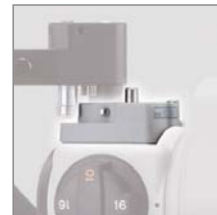
» Tonometer Mount for R900 (SO-TM1)