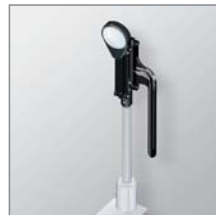
» Hruby Lens (SO-HL01)