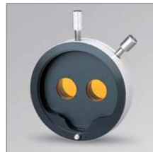
» Yellow Filter