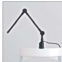
» External Fixation Target (SO-FT02)