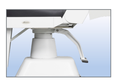
Foot activated rotation lock