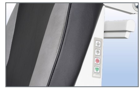
Fingertip switch panel