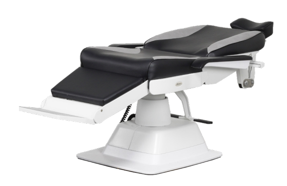
Encore Chair in fully reclined position